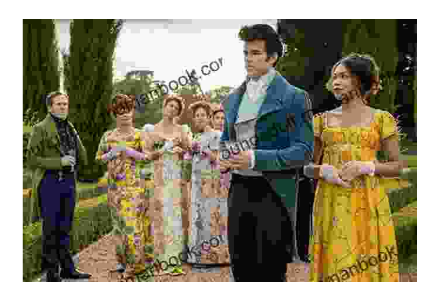
The Cultural Impact

Bridgerton is set in the Regency era, a period of significant social and political change in England. The series captures the essence of this era, with its strict social hierarchy, elaborate social rituals, and changing attitudes towards love and marriage. Bridgerton offers a glimpse into the lives of the upper classes during this time, shedding light on their customs, traditions, and beliefs.