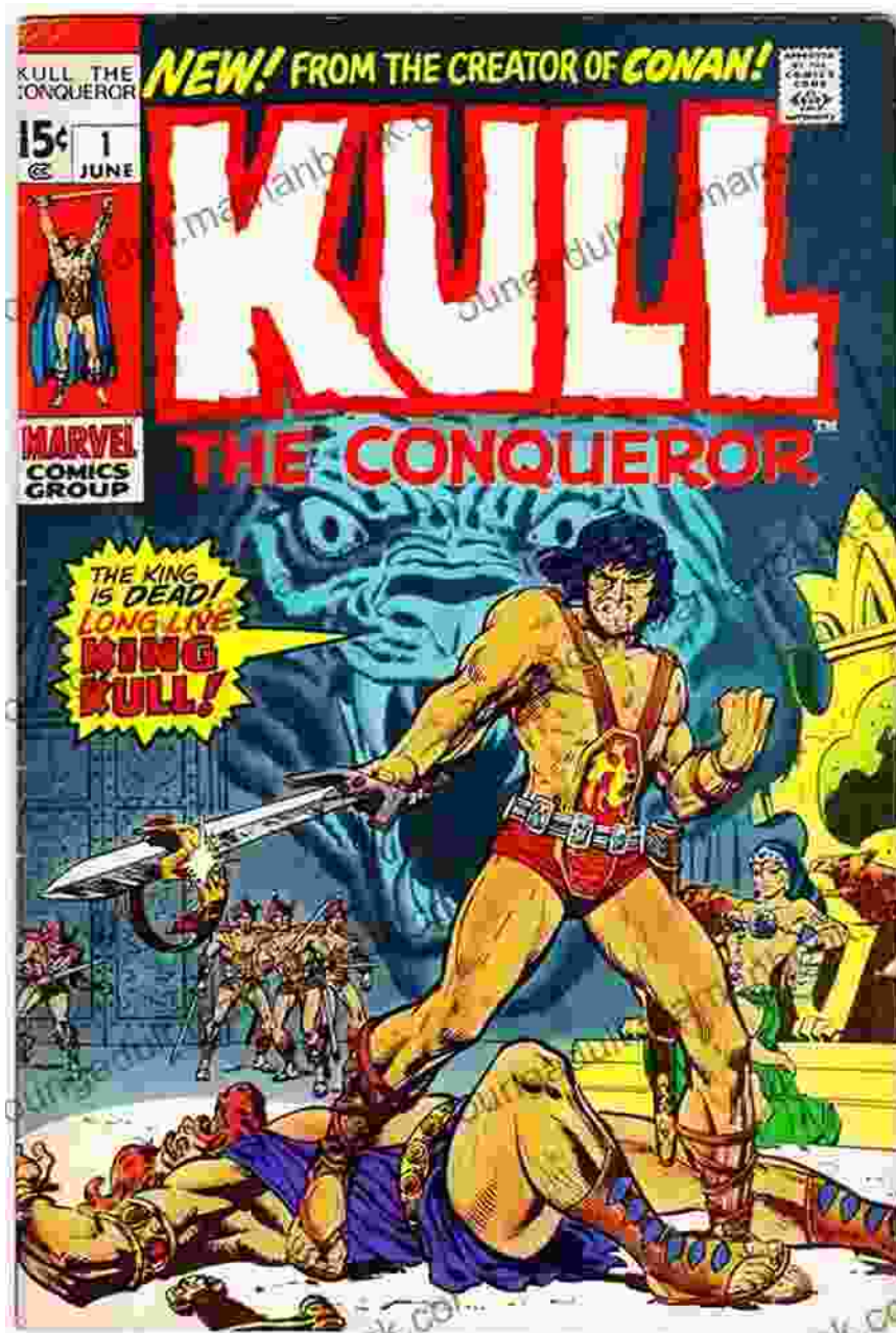
Kull the Destroyer: A Return to the Pulp Roots (1973-1978)

In 1971, Marvel Comics launched Kull the Conqueror, a comic book series that further expanded on Kull's adventures. The series, which ran until 1978, depicted Kull's rise from a lowly barbarian to a mighty king, detailing his battles against sorcerers, usurpers, and the forces of darkness.