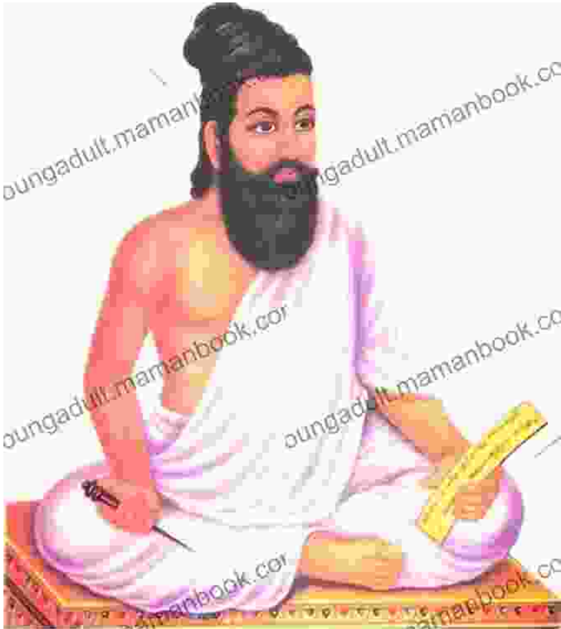
Thiruvalluvar, the renowned Tamil poet and philosopher

Thiruvalluvar (c. 2nd century CE) was a revered poet-philosopher whose wisdom has guided generations of Tamils. His magnum opus, "Thirukkural," is a collection of 1,330 couplets that encapsulate the essence of human ethics and morality.